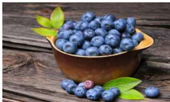
Photo 1. The first blueberry production obtained in the Republic of Moldova in 2016

The rest of the plantations have insignificant areas or the given crop is grown on the auxiliary sector, and the production obtained is intended for domestic consumption. The respective situation reveals the fact that blueberry cultivation in the Republic of Moldova is an underutilized niche, with a huge potential that is yet to be exploited at its true value.